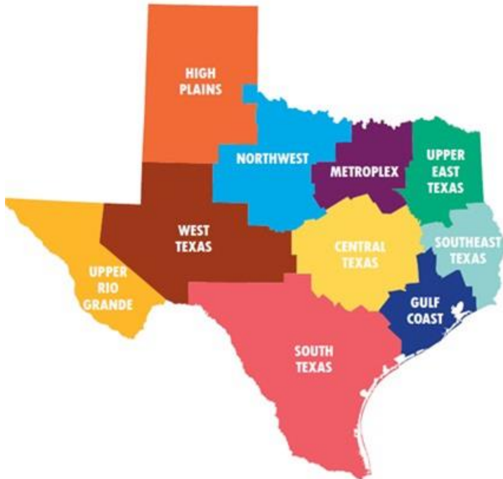
Figure 1. Texas Higher Education Coordinating Board's 10 Regions

Economics affect enrollment as well. Two-year college enrollment has usually expanded in times of increasing unemployment, in part because students want to update their skills to prepare for better jobs or jobs in different fields. During the Great Recession, enrollments surged at two-year colleges from 2008 to 2010. The pattern of decreased enrollments at two-year schools from 2011 to 2014 was similar to what has happened many times before; when the economy improves, many students, especially at the two-year level, bypass higher education for the workforce.