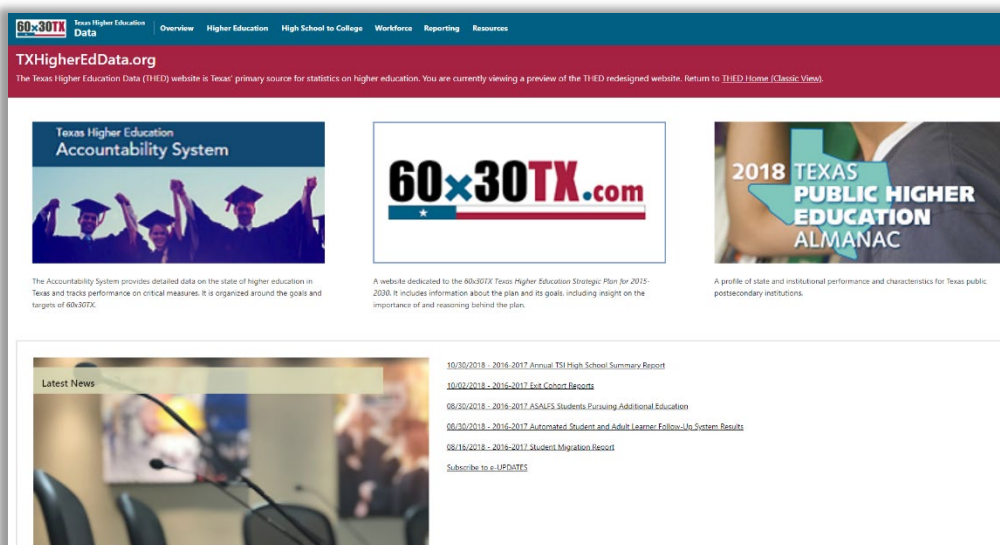
Figure 1. www.txhighereddata.org

This website is maintained by the Texas Higher Education Coordinating Board (THECB) and is intended primarily for users who wish to locate or generate data regarding higher education. The site provides direct access to various reports, statistics, queries, and interactive tools. As features are added or updated, a notification panel on the homepage titled Latest News assists users in identifying the most recent changes.