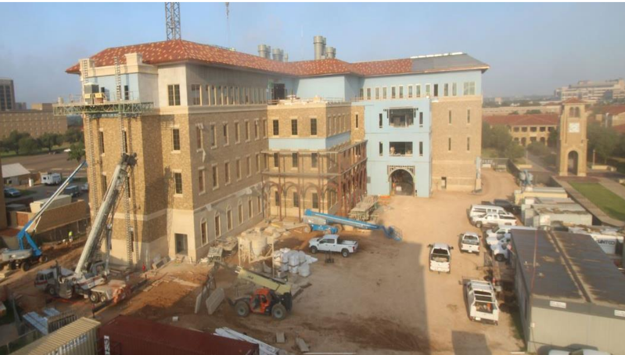
Photo: Experimental Sciences Building 2, Texas Tech University