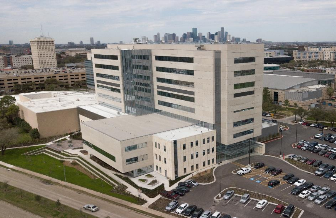
Photo: Health and Biomedical Sciences Building 2, University of Houston