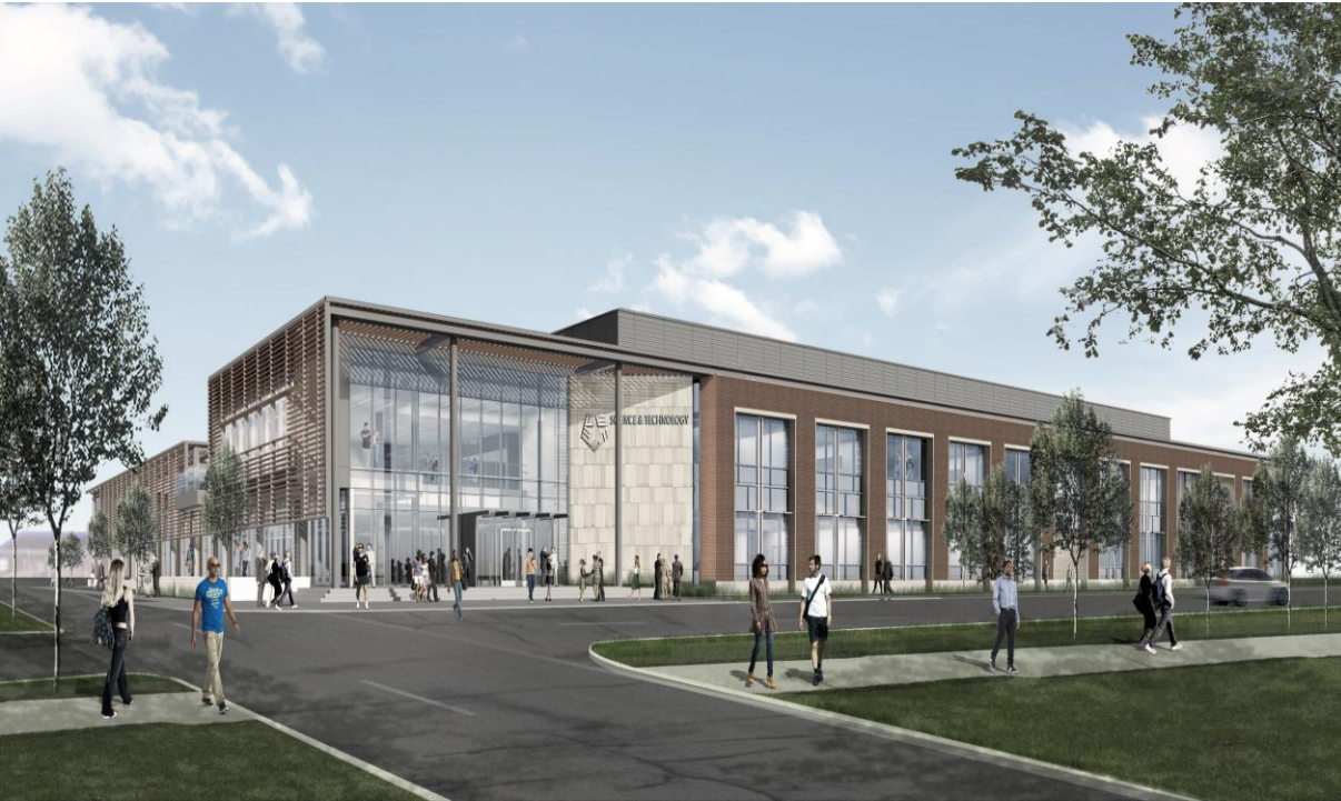
Rendering: Science and Technology Building, Lamar University