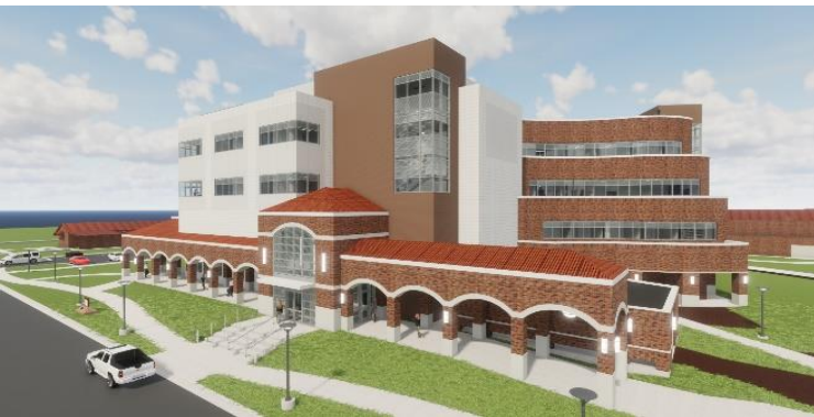
Rendering: Health Sciences and Human Services Building, Northwestern State University