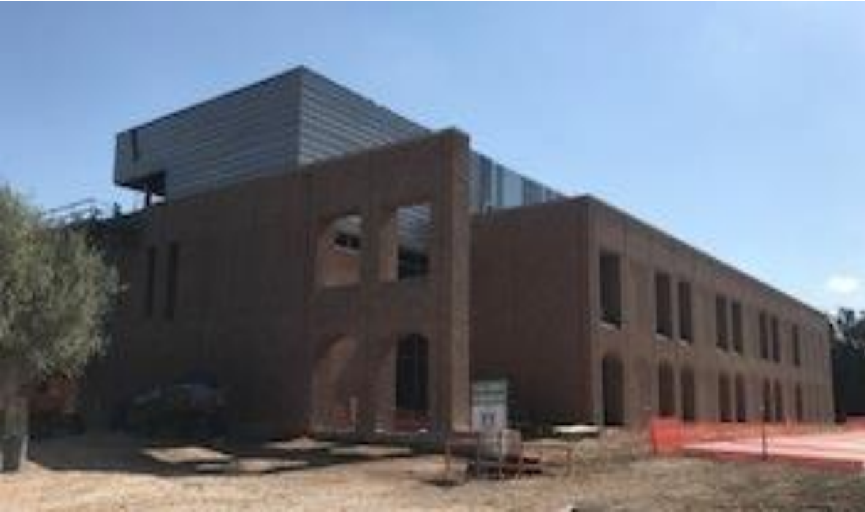
Photo: Interdisciplinary Engineering and Academic Building, The University of Texas Rio Grande Valley