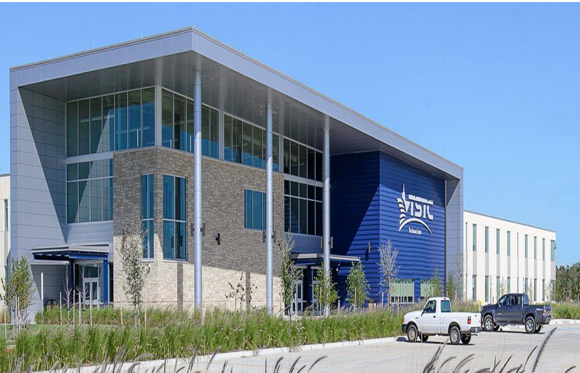
Photo: Brazos Center, Fort Bend Campus, Texas State Technical College