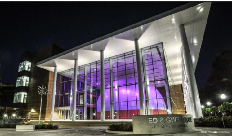
Photo: STEM Building, Stephen F. Austin State University