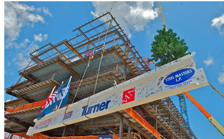
Photo: Library Learning Center Project, Texas Southern University